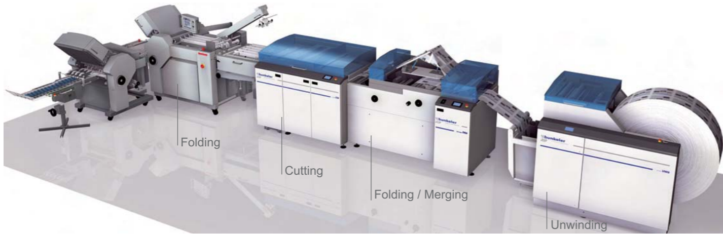
AF-566F Digital (Right angle 6+4 buckles) + Hunkeler sheet processing system

Easy operation and advanced technology increase the possibility of in-line finishing with surprisingly simple changeovers and application flexibility.