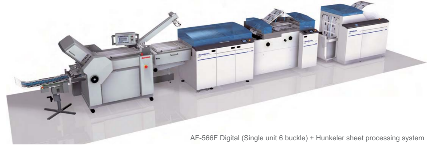
AF-566F Digital (Single unit 6 buckle) + Hunkeler sheet processing system