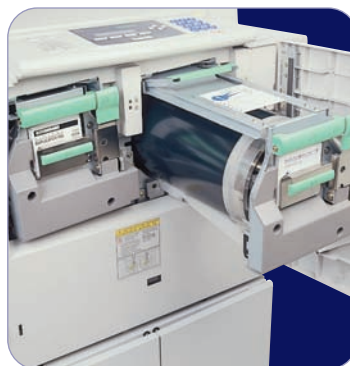
Two-Colors in One Pass

Specifications subject to change without notice. *Color drums sold separately