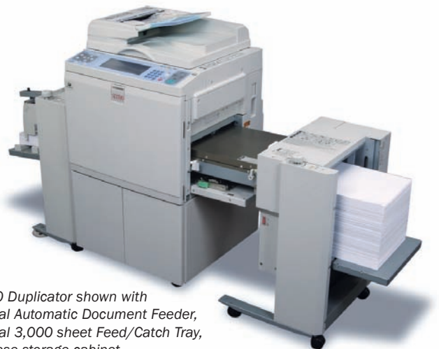
SD700 Duplicator shown with optional Automatic Document Feeder, optional 3,000 sheet Feed/Catch Tray, and base storage cabinet.